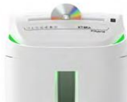
240 mm ENTRY THROAT