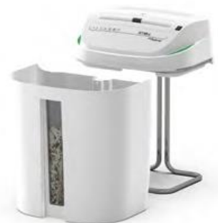
ECO-FRIENDLY REMOVABLE BIN